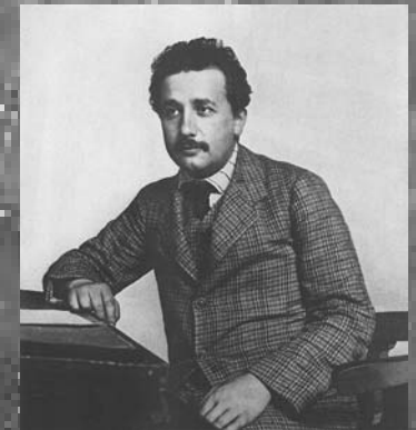
Albert Einstein in 1905 - his "Miracle Year"