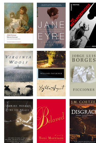
Some of the titles for the MOOC

The Library's Summer Reading Program is made possible thanks to the Friends of the Library. For more information visit www.ridgefieldlibrary.org or call 438-2282.